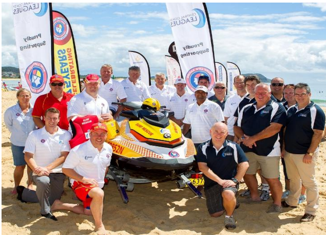
RWC Launch at Terrigal Beach

The Central Coast Leagues Club have recently come on board as the new sponsor of the Surf Life Saving Central Coast Life Saving Support Operations team. This team includes the most elite and experienced volunteer lifesavers on the Coast who support the 15 SLSC's through the provision of the Duty Officer Service, Rescue Water Craft (Jet Ski) Service and SurfCom Radio Operations Centre. The Central Coast Leagues Club were one of Surf Life Saving's original sponsors on the Central Coast and sponsored the Branch for approximately 40 years leading into the late 1990's, so it is fitting to reunite this partnership in the organisations 75 th Anniversary year. On Sunday the 1 st December SLSCC and Directors from the Central Coast Leagues Club launched a new Rescue Water Craft purchased out of the sponsorship.