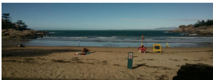
Alma Bay – Arcadian SLSC on Magnetic Island