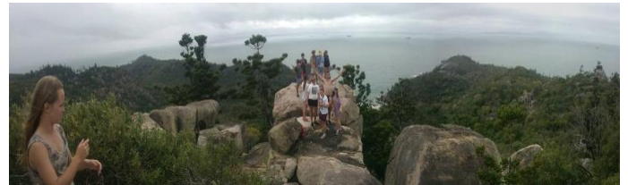
Sensational Magnetic Island views