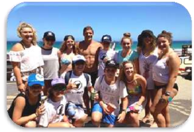
25<sup>th</sup> January 2015

The format for the day was an M-Shape where the men would complete 3 loops and the women would do 2. Each race was roughly 40 minutes and both the swell and run transitions changed up the competition order to keep the races interesting. It was a great day out and a brilliant experience for our youth members to watch some of the best Iron Men and Iron Women in the world do what they love.