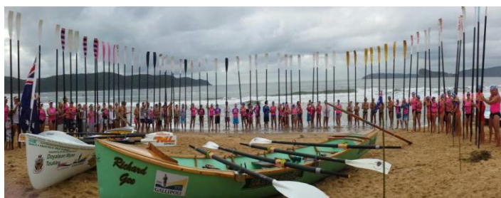
The very fitting tribute for the Gallipoli 100 crews @ Ocean Beach