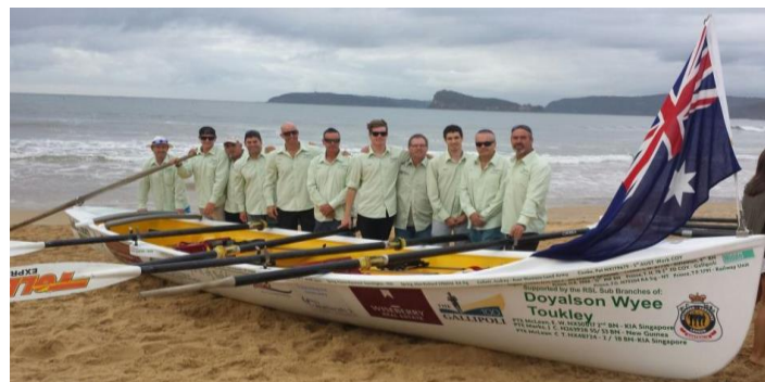
The proud and dedicated crew from Soldiers Beach SLSC with their boat aptly named the "Spirit of Soldiers"