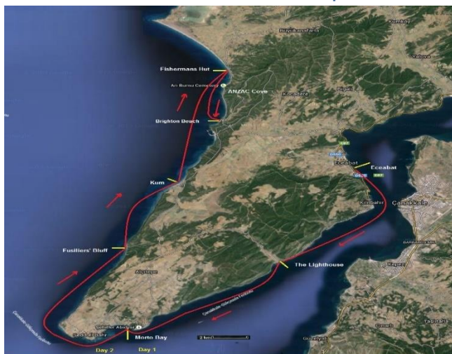
Map detailing the journey crews will embark on in Gallipoli