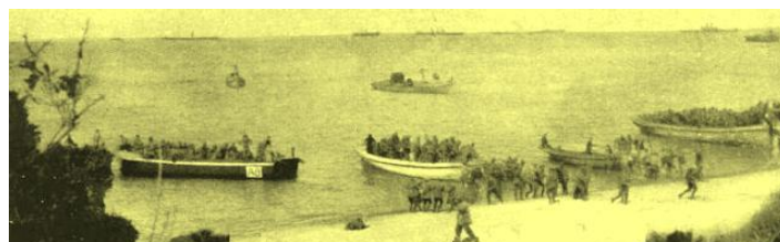
The landing at North Beach 1915 adjacent ANZAC Cove

SLSCC is really grateful and proud to be represented by these extremely dedicated and passionate members, we sincerely wish them all the best on this absolute trip of a life time..!