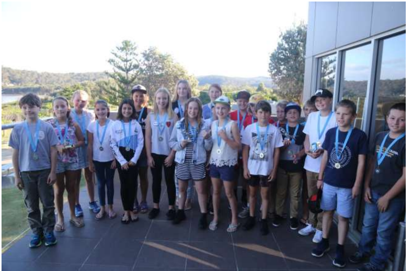
Junior Presentation- Award Winners U11