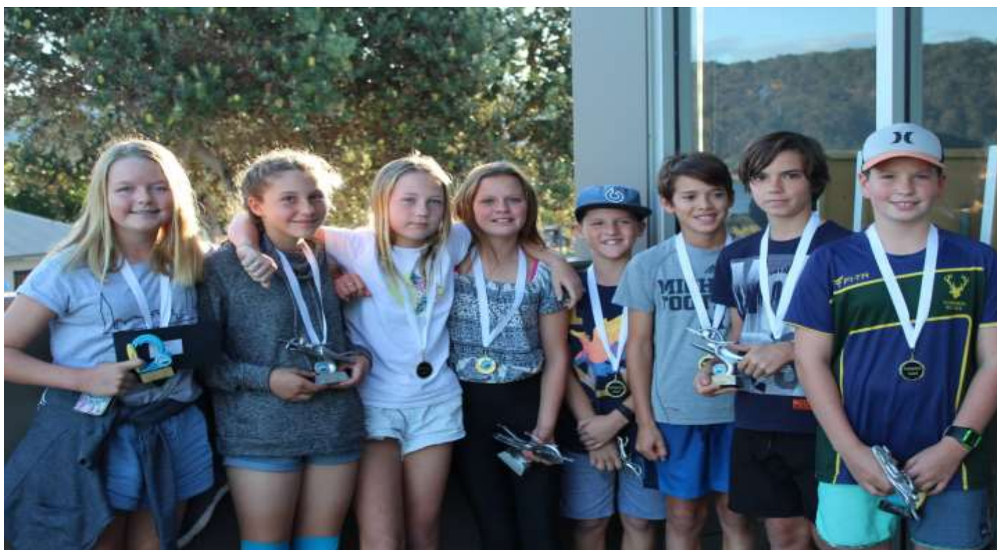
Junior Presentation - Award winners U12