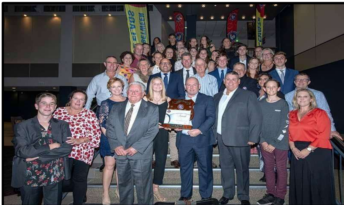
Club of the Year 2018/2019