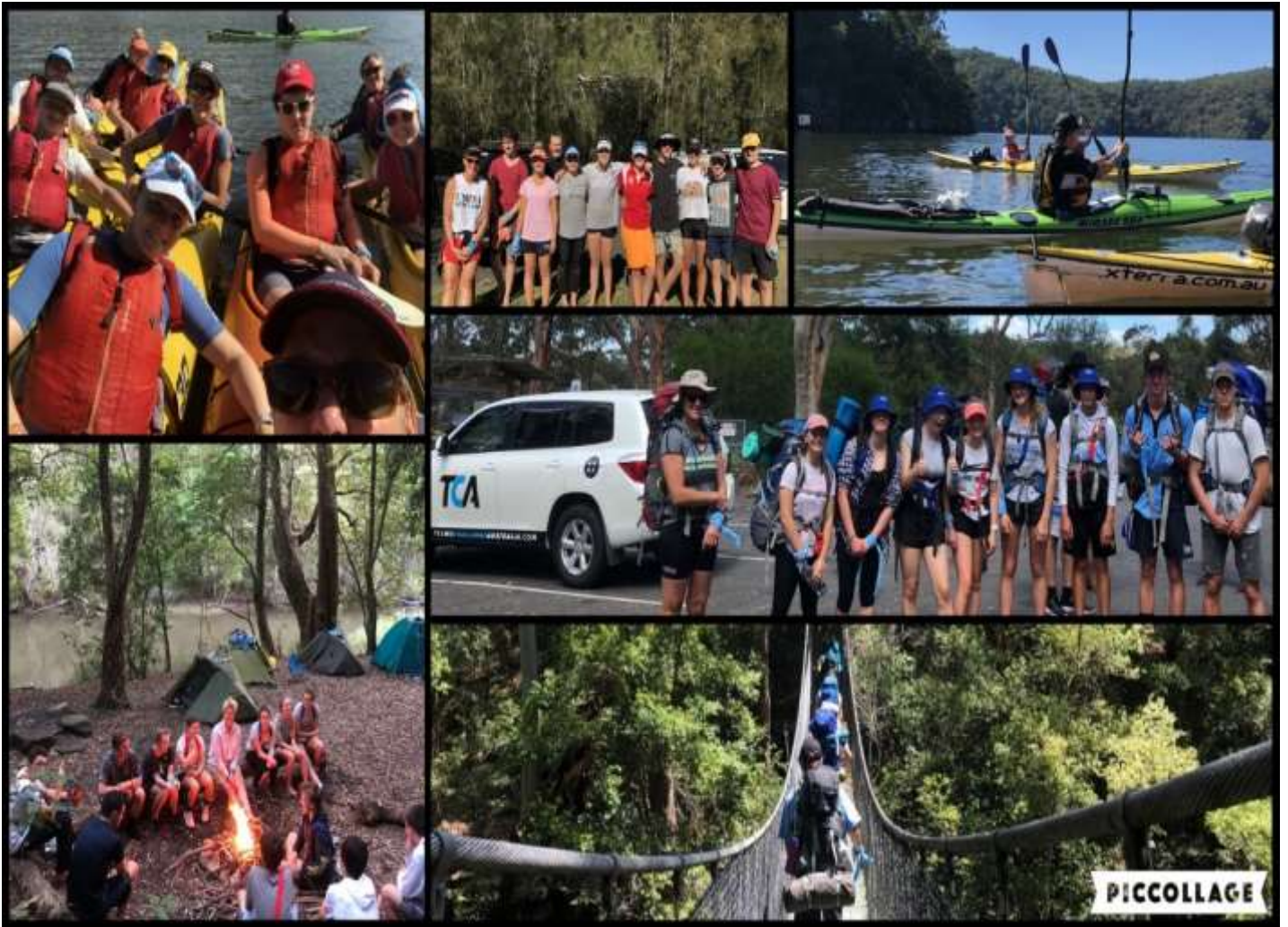
Snapshots from Duke of Edinburgh program